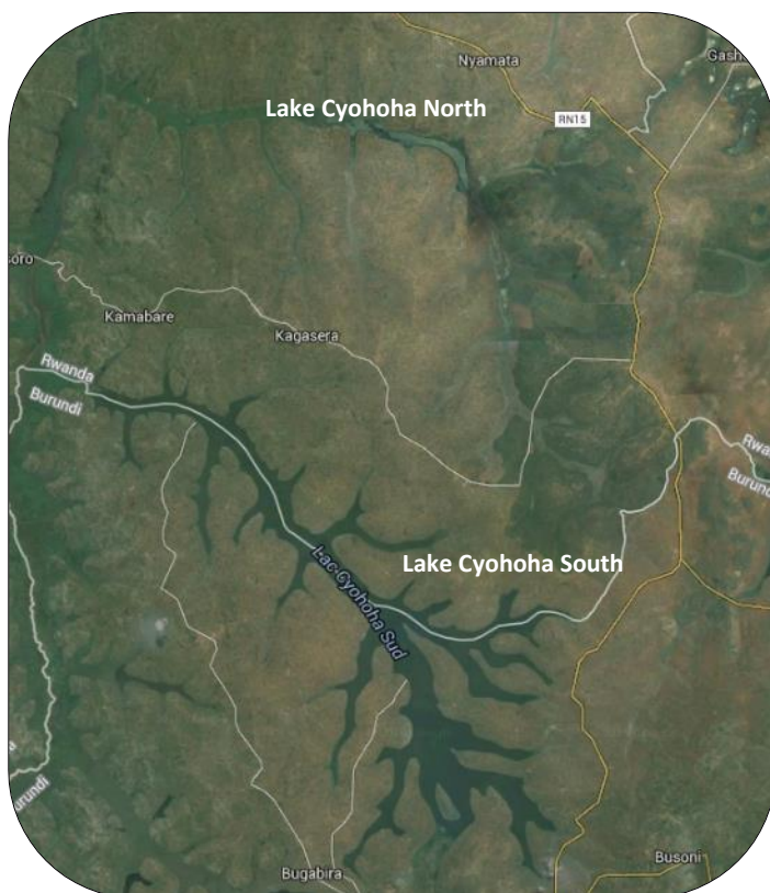
Figure 1: Lake Cyohoha Catchment

km 2 are located in Burundi and 139 km 2 in Rwanda. The lake is 27 km long and 5 to 2 km wide. It branches up to 9 km separated from the Akanyaru River by a series of swamps into the transboundary southern lake and the northern lake located in Rwanda (see figure 1).