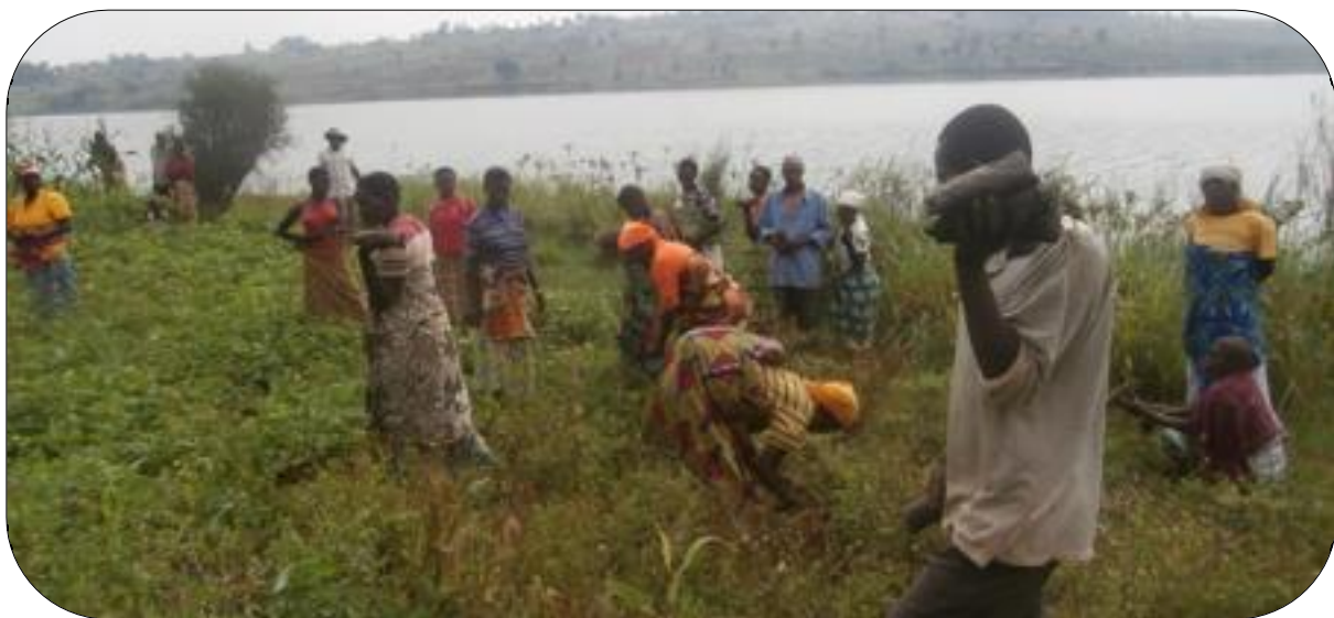
Figure 2: Tree planting by Burundi communities in the lake buffer zone

The tree planting activities were also extended to the residents in the Kirundo province of Burundi who planted 10,000 trees for up to 50 meters around the lake shores. WACDEP activities are also helping the Burundi government to reach their goal of 18% of forestry cover by 2025 in order to increase climate change resilience.