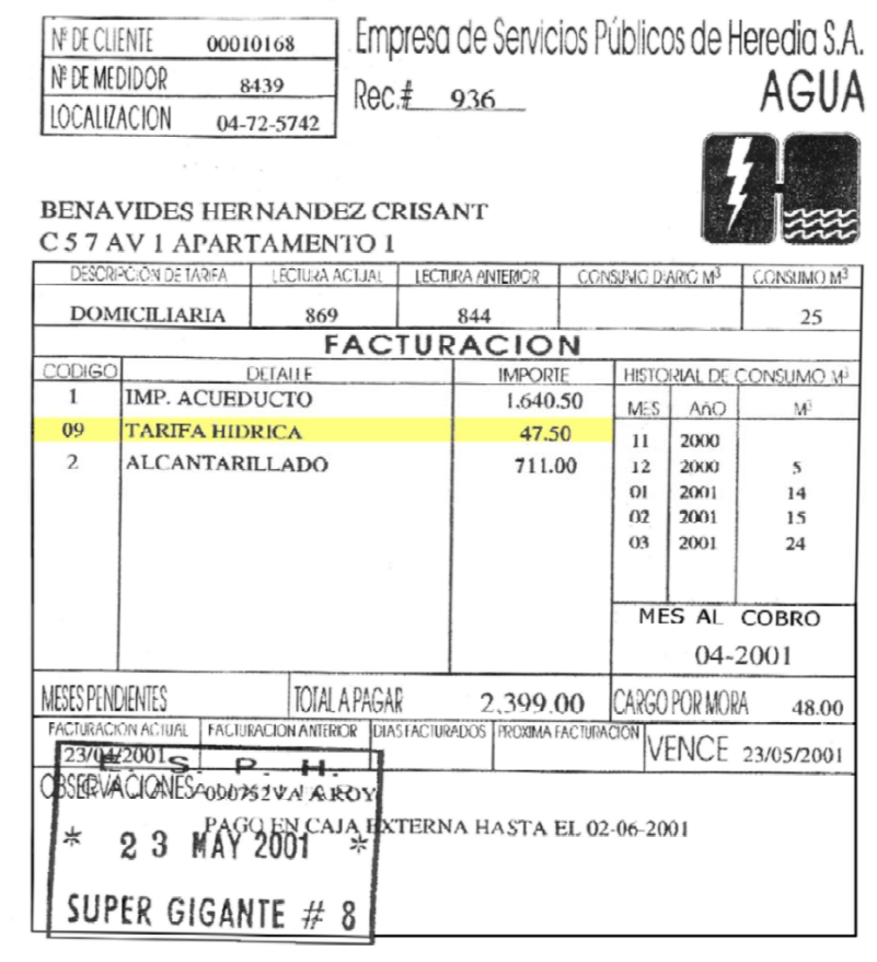
Figure 2 Receipt showing the amount charged to protect water resources <sup>4</sup>

In 1999 the Utility Company of Heredia (Empresa de Servicios Públicos de Heredia S.A.--ESPH) presented a proposal to the regulatory agency ARESEP and was the first to obtain approval for a water fee that included a small portion to be used to protect watersheds and recover degraded river basins (see exhibit 1). After considerable debate the amount approved for this environmental component was \not\subset 1.90\ /m^3 (US$0.00543 /m^3 ). The amount proposed was \not\subset 20.83/m^3 ($0.0595/ m^3 ). For example, a person consuming 25 m^3 would pay \not\subset 47.50 ($0.1357) for environmental services, which is about 2 percent of the total payment for water services.