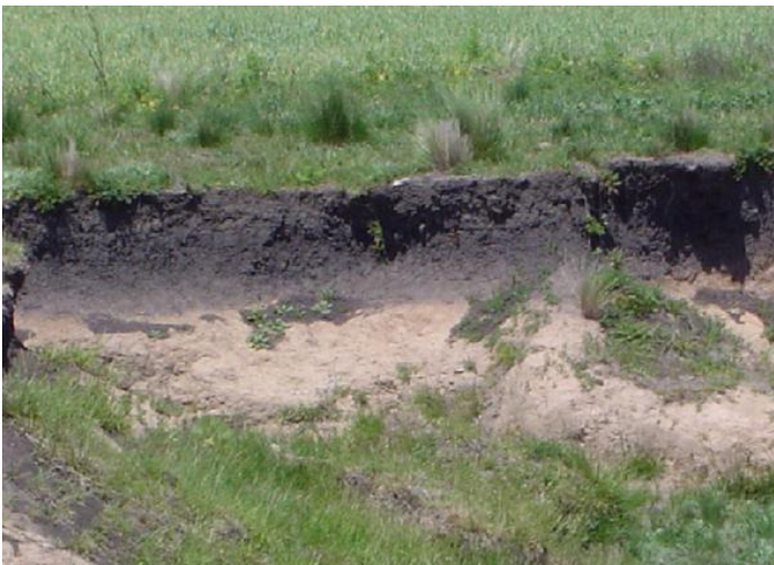
Figure 1. Soil loss by surface water erosion