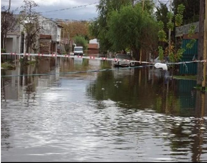
Figure 2. Flooded urban area

The floods have a direct effect on the quality and quantity of water available. Therefore to find lasting solutions to the problems in the basin, there was a need for technical and cultural knowledge dissemination. This focused on the dynamics of water resources in urban and rural population, public and private institutions, regarding: