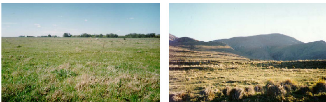
Figure 4. Basin Environments

The basin is located in one of the most productive regions of Argentina. The roads that connect the southernmost parts of the country with the capital and the far north, as well as the Andean provinces of the west with the ports of the Atlantic coast, intersect there. The basin covers a region with a distinct topographic dimorphism, presenting a highland area with elevations between 250 and 650 meters, and a plain that can reach about 125 meters, where agricultural activities predominate as seen in figure 4.