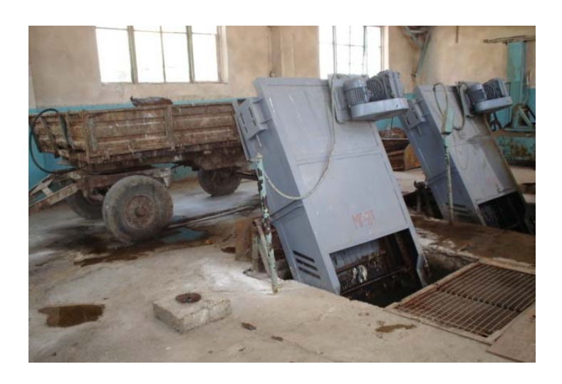
Picture 3.3. Debris filter of the treatment facilities in Fergana, Uzbekistan