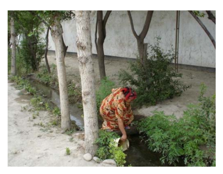
Picture 3.1. Over 40% of rural population in Fergana Valley use untreated water for household needs out of the wells and aryks (open ditches).

In Uzbekistan there are 265 cities, towns and settlements, 11.844 villages, including 903 in the hardly accessible small villages. In certain provinces of the country (Bukhara, Khorezm, Karakalpakstan) coverage of population with water supply systems is only 20-25 %. Water ducts and water supplying pipelines in the cities and settlements of the country are made out of the steel pipes. During the last 20-25 years of their operation, their wear-and-tear rate has reached 50%. Water pipelines are not being to their full capacity, thus water losses reach the rate of 40%. The oldest and the most developed system in Uzbekistan is the potable water supply system of the city of Tashkent. Water supply of Tashkent is being effectuated out of two sources: surface and underground located in the basin of Chirchik River.