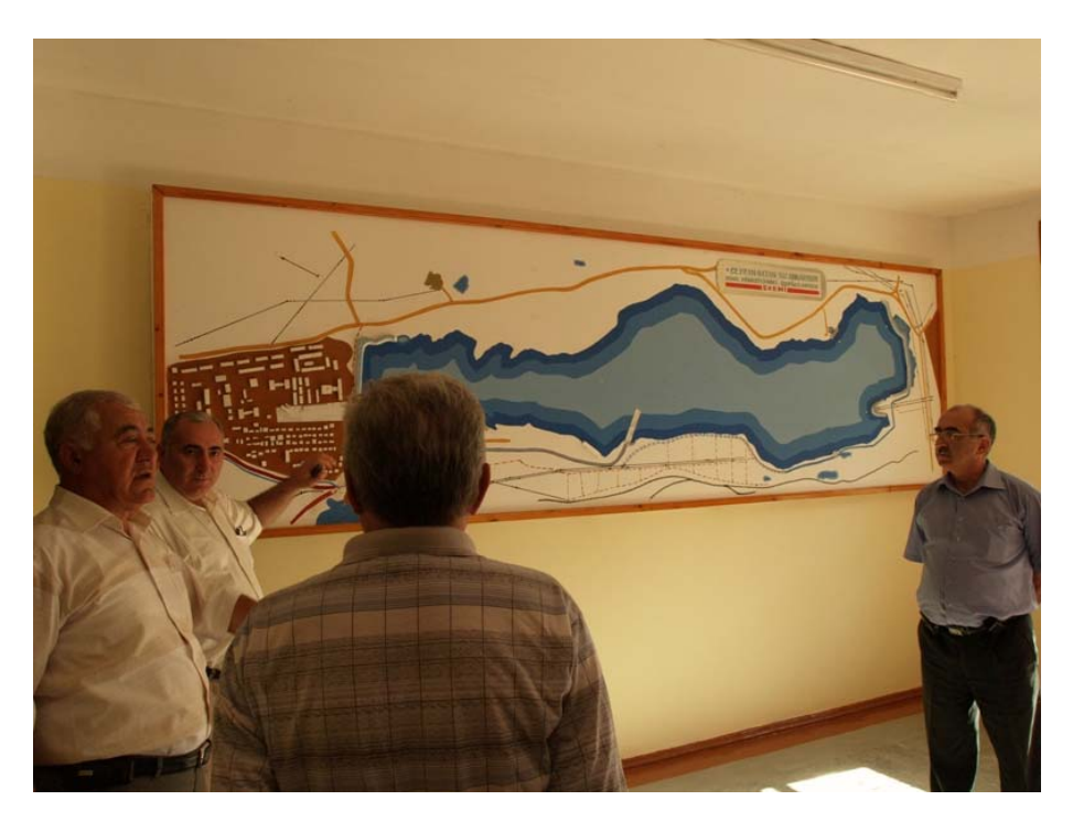
Picture 5.1. Azeri colleagues explain to GWP CACENA delegation their plans of reconstruction and development of the water supply system in the areas surrounding Baki at the expense of the state budget of Azerbaijan (2008)

Distribution of the WSS regulation functions among various ministries and state authorities that have different priorities does not facilitate achievement of the required level of functioning, operation and the overall and equal development of WSS systems. Institutional structures for regulation, management and development in many countries of the region still need reforms depending on the national policies and strategies in each of the regional states.