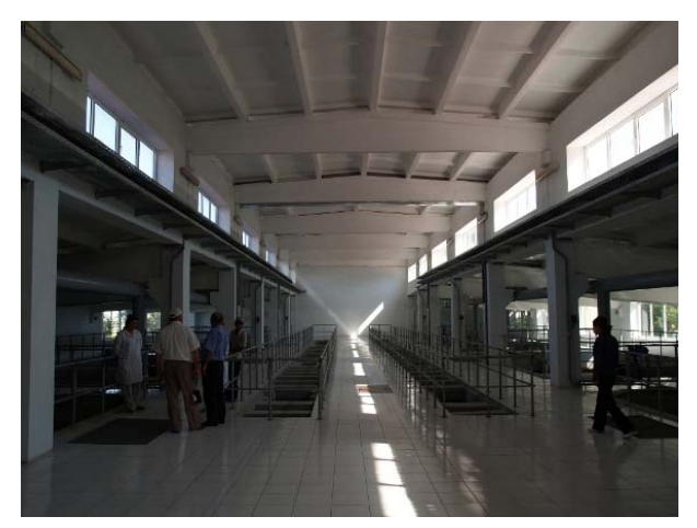
Picture 3.1. Newly constructed chlorination plant for drinking water in Azerbaijan

In Soviet period about 20 sewage treatment plants used to operate in Armenia, they used to cover the capital city of Yerevan, 25 other cities and towns and 55 rural settlements. Out of the number of existing STPs at present only the Yerevan Aeration Plant is operating, effectuating only mechanical treatment of some portion of the sewage. Starting from 2004 decisive steps have been taken in order to rehabilitate the sanitation and sewage treatment plants of Armenia.