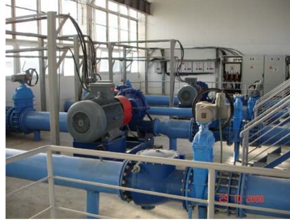
Picture 3.2. The Ararat Pump Station: prior and after reconstruction

In Georgia the coverage of centralized sewage system on average ranges from 28,7% in small settlements to 93,2% in major cities. However, in some urban settlements there is no centralized sewage system. Sewage systems are available in 45 cities of Georgia, but the state of those systems is very poor. STPs have been built in 33 cities. Those plants were put into operation during the period of 1972-1986. At present, none of the biological treatment steps of the plants is functioning. Mechanical treatment of sewage is being operated to some extent only in the STPs of Tbilisi and Rustavi, however the major part of the facilities is virtually out of operation. In settlements, where there are no treatment plants, sewage discharge directly into the natural surface water bodies. In recent years one sewage treatment plant with complete biological treatment has been built in the city of Sakhchere.