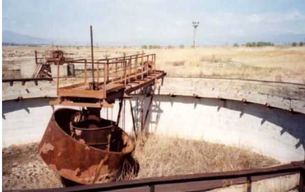
Picture. 3.4. Actual state of some of the treatment plants in the Southern Caucasian countries